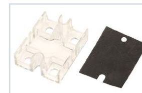
Protection Covers & Thermal Pads