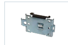
DIN Rail Socket Plates